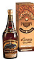
AKHTAMAR Aged 10 years