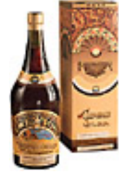
VASPOURAKAN Aged 18 years